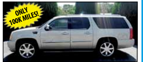
2008 CADILLAC ESCALADE ESV #13416-249 $499 00 * DOWN