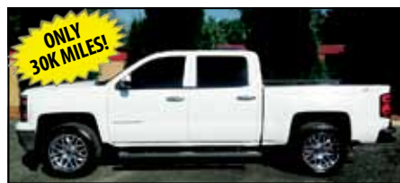
2014 CHEVROLET SILVERADO 1500 LT #32209-369 $499 00 * DOWN