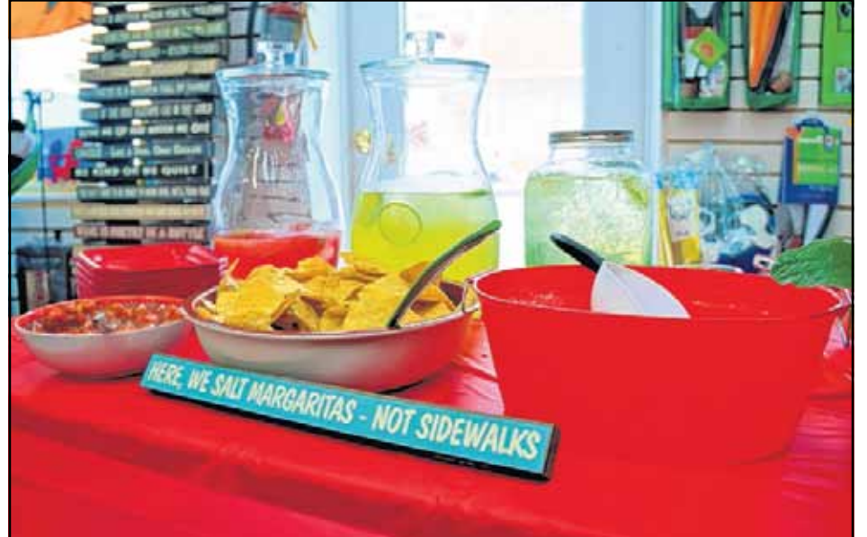
Shoppers were in for some yummy surprises. Many stores offered up some complimentary food and beverages to their guests, including chips and salsa, margaritas and mojitos.