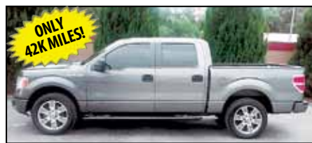
2014 FORD F-150 STX #87896-289 $499 00 * DOWN