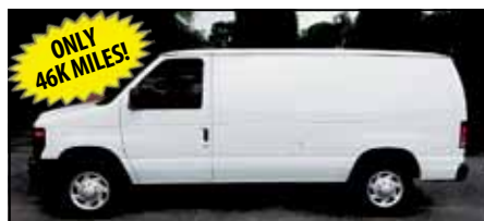
2014 FORD E-150 CARGO VAN #15973-209 $499 00 * DOWN