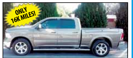
2014 RAM 1500 LARAMIE #89937-399 $499 00 * DOWN