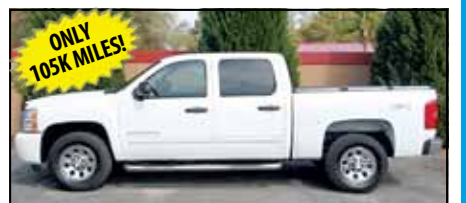
2010 CHEVROLET SILVERADO 1500 LT #94216-219 $499 00 * DOWN