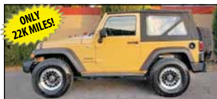
2013 JEEP WRANGLER SPORT #27649-289 $499 00 * DOWN