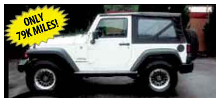
2012 JEEP WRANGLER SPORT #13716-239 $499 00 * DOWN