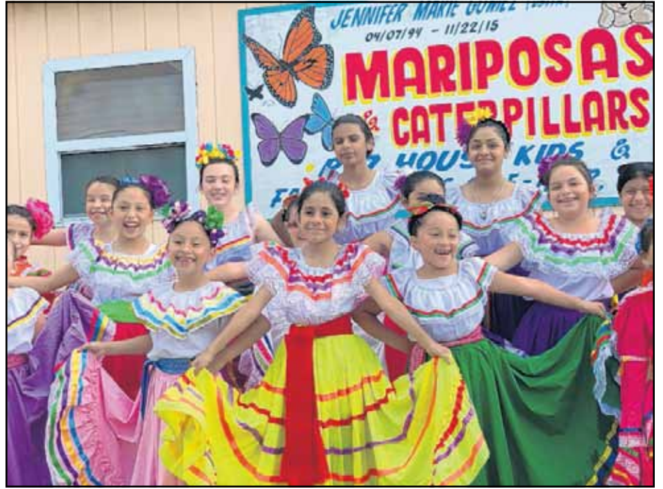
The winning photo showing members of Las Mariposas (The Butterflies) dance troupe of Farmworkers Self-Help in Dade City during the annual Cinco de Mayo parade in Dade City.

Winners will receive a trophy, monetary award and recognition at the League's Annual Conference. They will also be featured in the League's statewide publication, Quality Cities magazine; and have their win presented on the League's