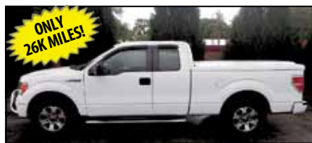
2014 FORD F-150 STX #62815-275 $499 00 * DOWN