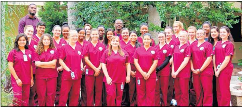
Florida Hospital Zephyrhills was one of the few in the region to host a two-week academy in late June for high school students interested in pursuing a medical career. Shown is the class of 2017 and some of their leaders.