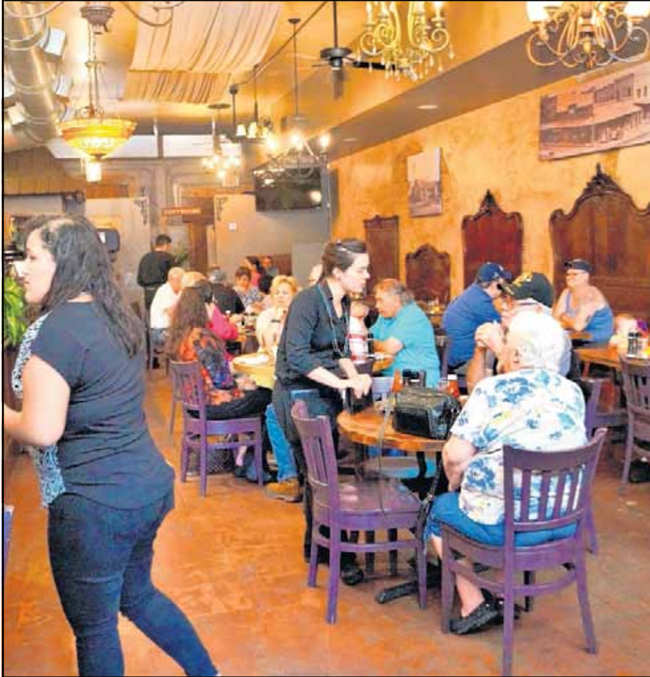
Owned and operated by Louisiana natives, the Cajun cuisine at the newly opened Orleans at City Market is about as authentic as you can get.