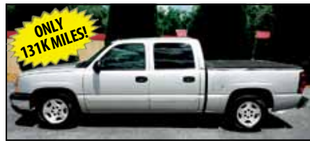
2005 CHEVROLET SILVERADO 1500 LT #66599-135 $499 00 * DOWN