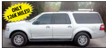
2012 FORD EXPEDITION XLT #33643-219 $499 00 * DOWN