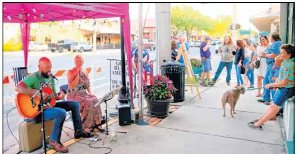
While many First Friday attendees crowded the stores, others crowded the streets to listen to some tunes performed by talented local artists.