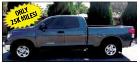
2012 TOYOTA TUNDRA #27441-259 $499 00 * DOWN