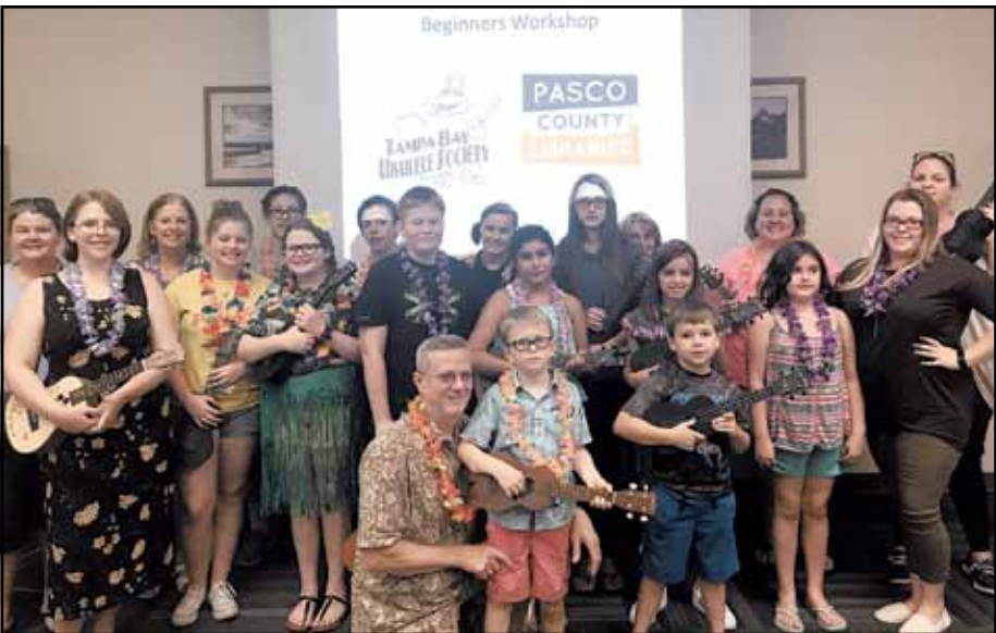
Ukulele Summer Camp participants celebrate the end of the July camps.