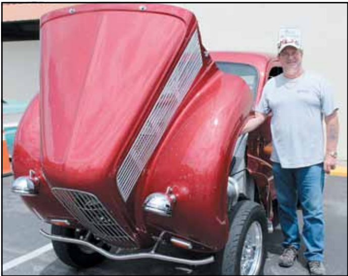
A 1950 Anglia packing a 427 cubic-inch engine was a popular vehicle to passersby during a past Cruise In in downtown Dade City.