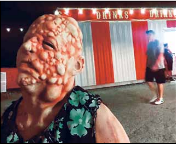
Creepy creatures love to get up close and personal with unsuspecting attendees during the seasonal haunted houses.