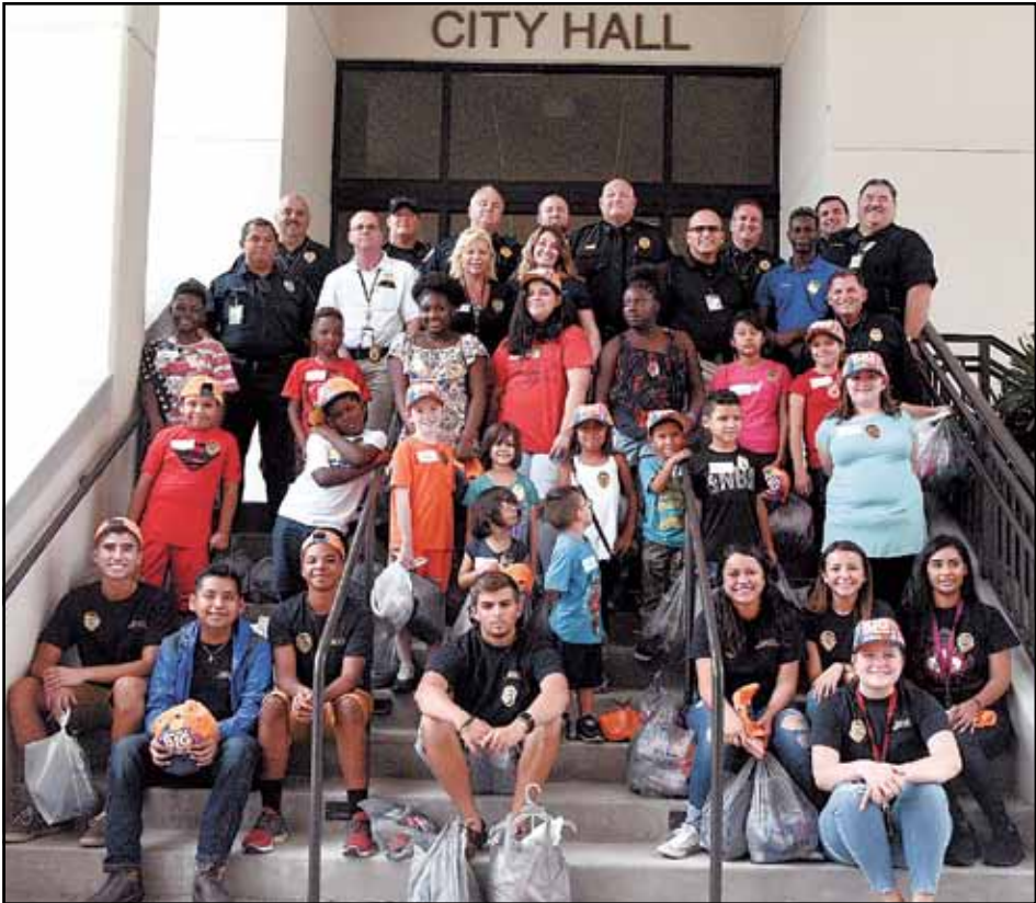
All the students, the members of the Dade City Youth Council and the involved Dade City Police Department officers and staff after Friday’s event.