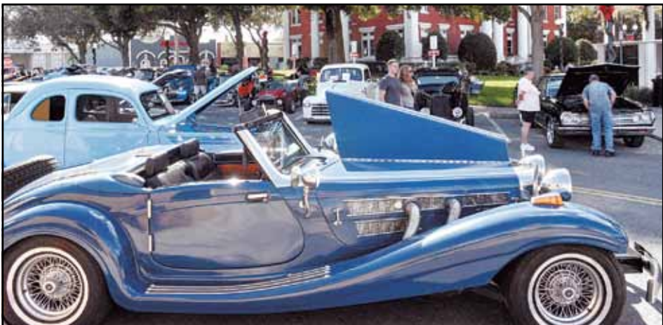
The next Cruise In in downtown Dade City will be held Sept. 1 and will continue to be held the first Saturday of each month through May 2019.