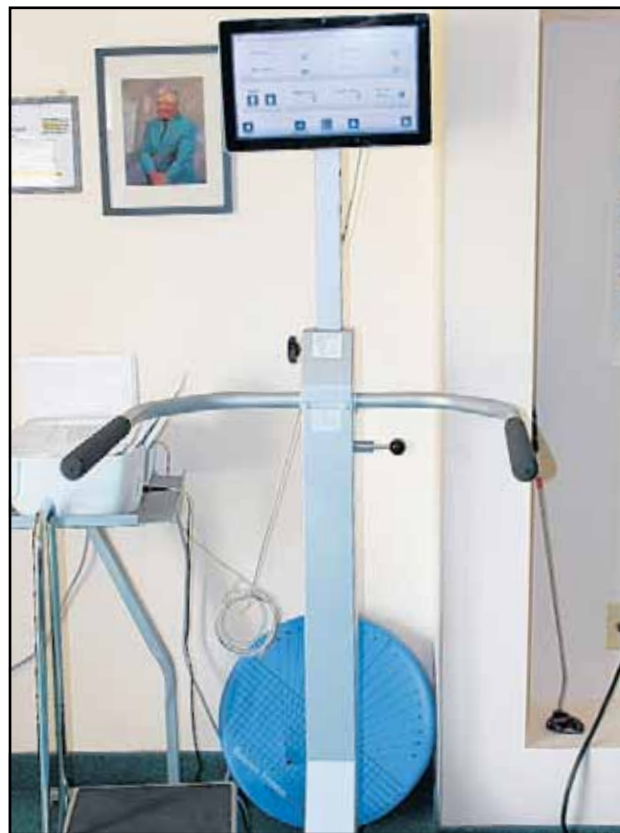
A machine once used to help senior citizens is now being used to test young athletes for brain injuries.

"The kids are the most important. I've seen kids get