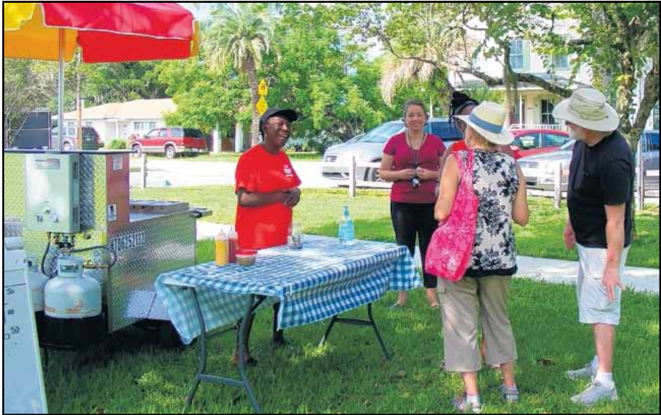
Customers enjoyed D&R's Specialty Hot Dogs on Saturday.