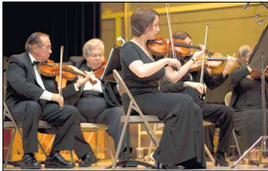
The Dade City Symphony will hold their fall concert on Saturday at the Pasco Middle School Auditorium, on 14th Street, at 6:30 p.m. See page 5A