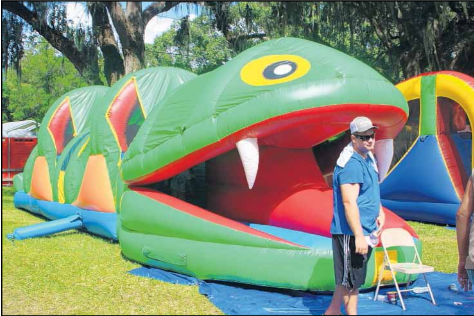
Even the bounce house had the rattlesnake theme at this year's 50th anniversary of the town's festival.

Proceeds from the two-day event go to Rotary charities, which benefit the children of San Antonio as well as the parent organization's international effort to end polio.