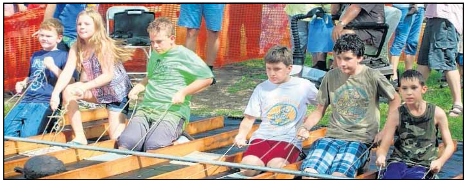
The gopher races were once again the highlight for the kids at the city park in the center of San Antonio.