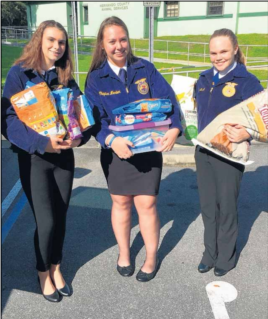
On Oct. 13 the Centennial Middle School FFA Chapter donated more than 45 items to the Hernando animal shelter. Items included dog food, cat food, treats, and toys. Such a great impact on the community could not have been made without the help of members, family and friends.