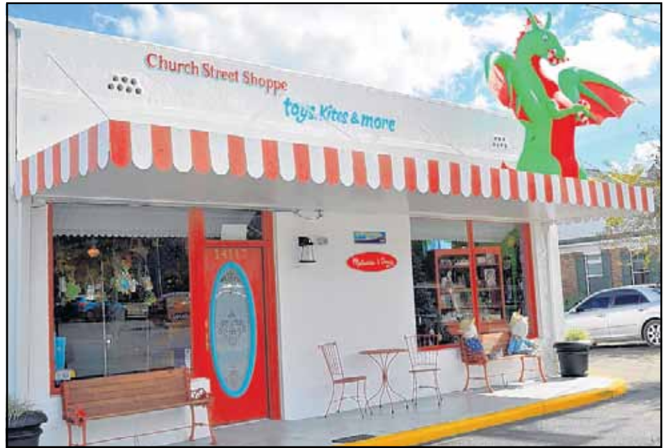
Dade City’s new toy store officially opened Oct. 31 at 14117 Eighth St. The store sells toys and products meant to get kids using their hands, minds and imagination.