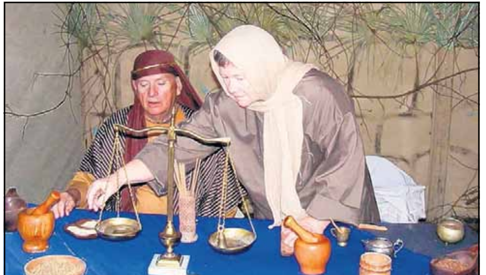
This man and woman show how spices were sold at the time of Jesus' birth.