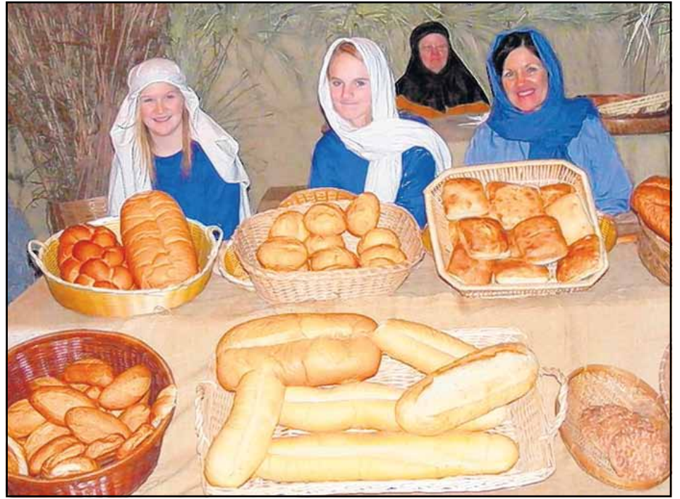
Bread was the main staple at this shop in a previous Walk Through Bethlehem.

There is no charge to take the guided tour of the city. However, Warren said, people who want to may make a free-will offering to help cover expenses for this year's event.