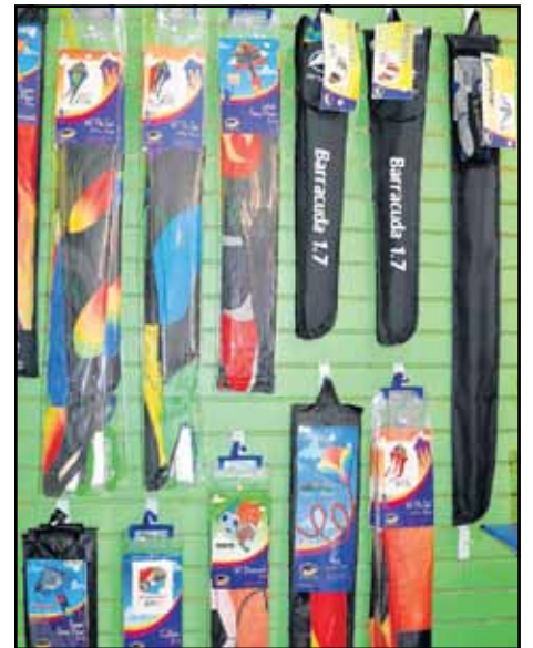
Kites are one of the main merchandise items at the recently opened Church Street Shoppe. The kites come in a variety of shapes, colors and sizes.

Call (352) 523-2422 or visit the Church Street Shoppe: Toys, Kites and More’s Facebook page for information and hours.