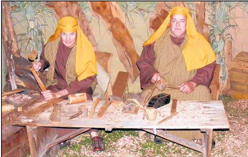
Market vendors show how tools were used in a workshop in ancient Jerusalem.

More information about Walk Through Bethlehem may be obtained by calling (352) 567-2990, or by visiting the church's website at www.richlandbc.org .