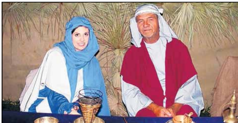
When walking through Bethlehem, viewers will be able to see Biblical characters as well as different market vendors popular to the time. This couple sold bowls in a previous Walk Through Bethlehem event.