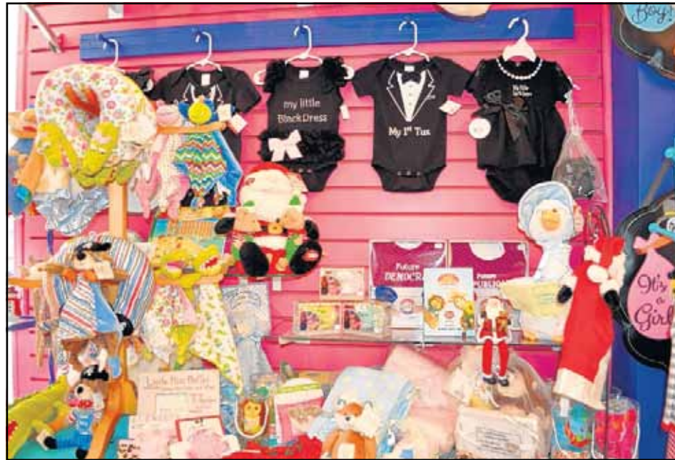
The walls of the Church Street Shoppe toy store are filled to the brim with toys for both boys and girls of any age.

Cunningham has named Puff, stands atop the red and white awning and will be the star of the shop’s float in the Magical Night Christmas Parade on Friday. A hopscotch path is painted on the sidewalk leading up to the shop’s red doors.