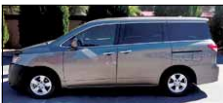
2014 NISSAN QUEST SV #02293-175 $17,495*