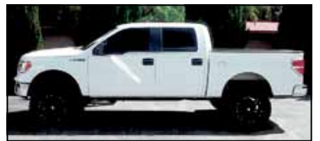
2013 FORD F-150 XLT #49293-299 $27,995*