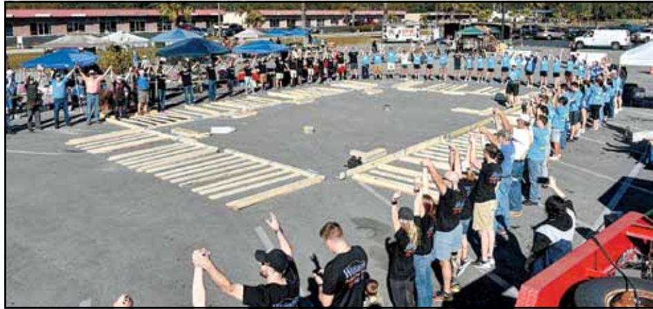
Before each building project, the group is asked to celebrate the occasion and repeat that Habitat provides not a "hand out, but a hand up."

Habitat's mission is to eliminate poverty housing and to make decent shelter a matter of conscience and action.