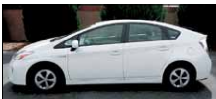
2014 TOYOTA PRIUS TWO #81170-165 $16,495*