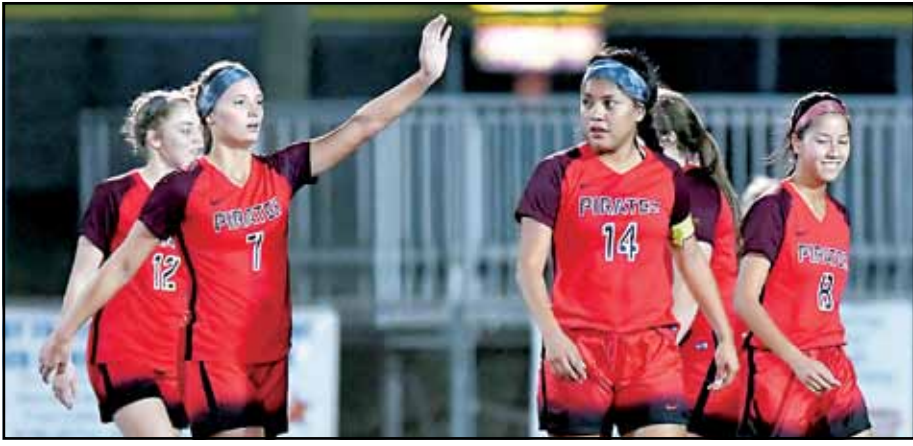
The Pasco High School girls soccer team overpowered rival Zephyrhills in their 9-Mile War with a 9-1 victory on Friday evening.