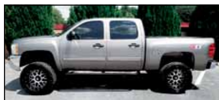
2013 CHEVROLET SILVERADO 1500 LT #66833-239 $23,995*