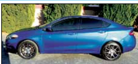
2013 DODGE DART SXT #32640-119 $11,995*