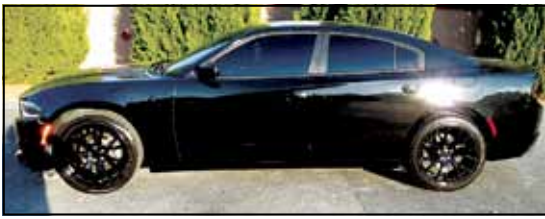
2015 DODGE CHARGER SE #68253-185 only $18,495*