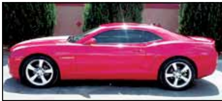
2011 CHEVROLET CAMARO LT #65759-199 $19,995*