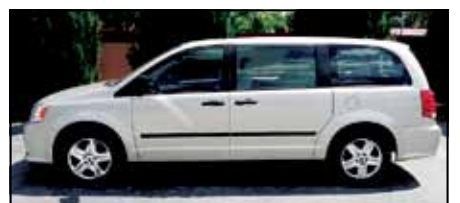
2014 DODGE GRAND CARAVAN SE #02290-159 $15,995*

DID YOU DRIVE IN FOR THE WINTER? That long journey can put wear on your car. Come by for a FREE vehicle inspection!