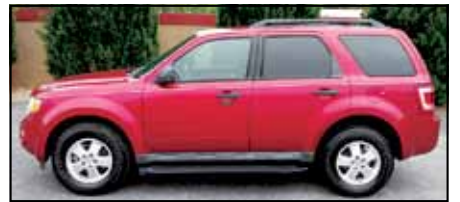
2012 FORD ESCAPE XLT #62773-12977 $12,977*