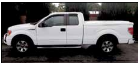
2014 FORD F-150 STX #62815-275 $27,495*