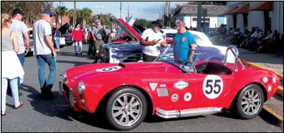
Several people stopped to look at this sports car that was displayed on Dec. 2.

ranging from classic street rods to late model Mustangs and Corvettes. One person had a 1953 Hudson J at the show while another had an early model Crosley station wagon. A disc jockey spun some discs with different types of music to entertain those attending the event. Area businesses and restaurants stayed open during the show so those attending could do some early Christmas shopping or get a bite to eat.