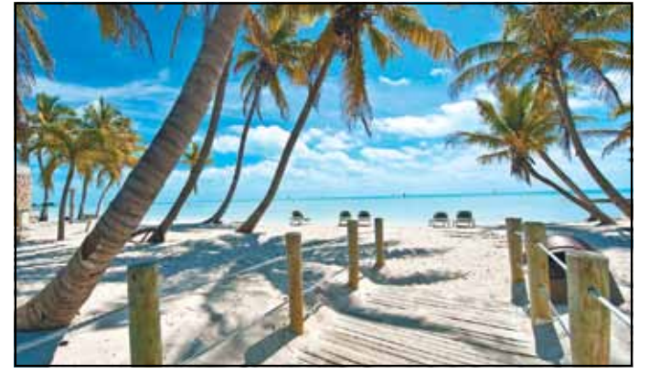
Includes: 2 Nights Hotel in Florida City • 1 Day in Key West 3 Breakfasts • Roundtrip Transportation from Zephyrhills All Taxes and Service Charges