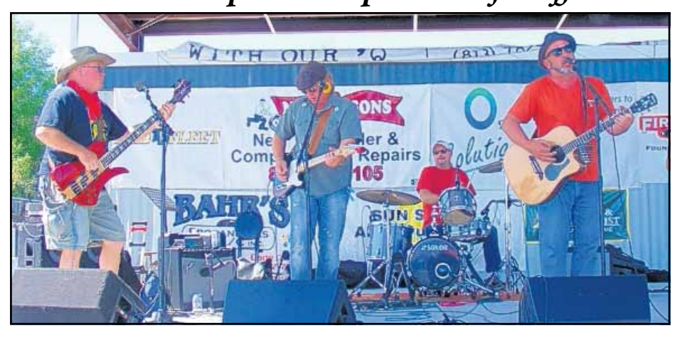
A variety of performers gather each year to participate in Paulie Palooza. This year's lineup will focus on the snowbird and senior population, featuring performances from local bands made up of retirees.

Popular Hospice Benefit Offers Something New