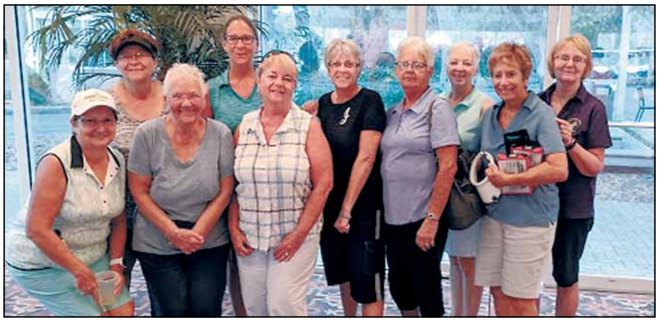
Ladies who played in the golf outing.