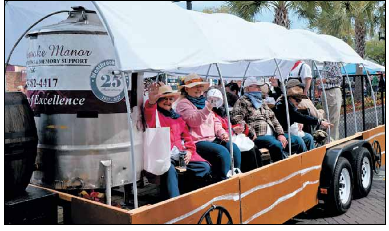
Residents from Westbrooke Manor Assisted Living spread some old-fashioned country fun from aboard their covered wagon float.