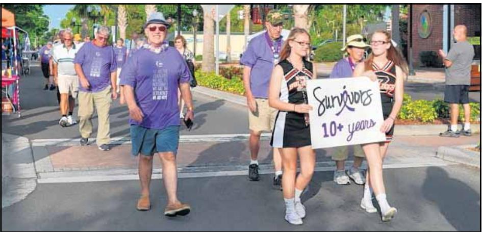
Zephyrhills High School cheerleaders lead a group of survivors at last year’s Relay in downtown Zephyrhills.