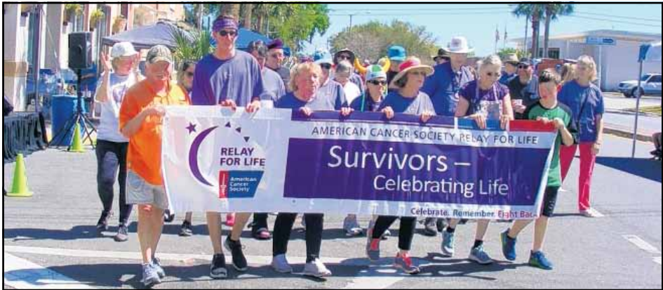
Survivors walk the first lap leading the pack in support of finding a cure for cancer at last year’s Relay for Life in Dade City.