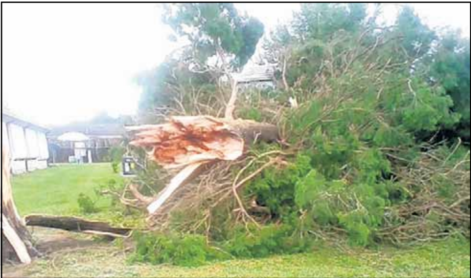
Fallen trees were a common sight following Irma in September.