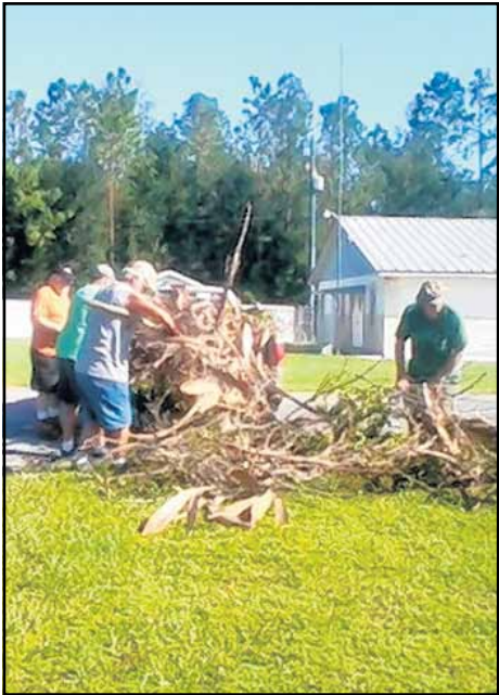
Summer residents working together to clear up debris following Hurricane Irma.