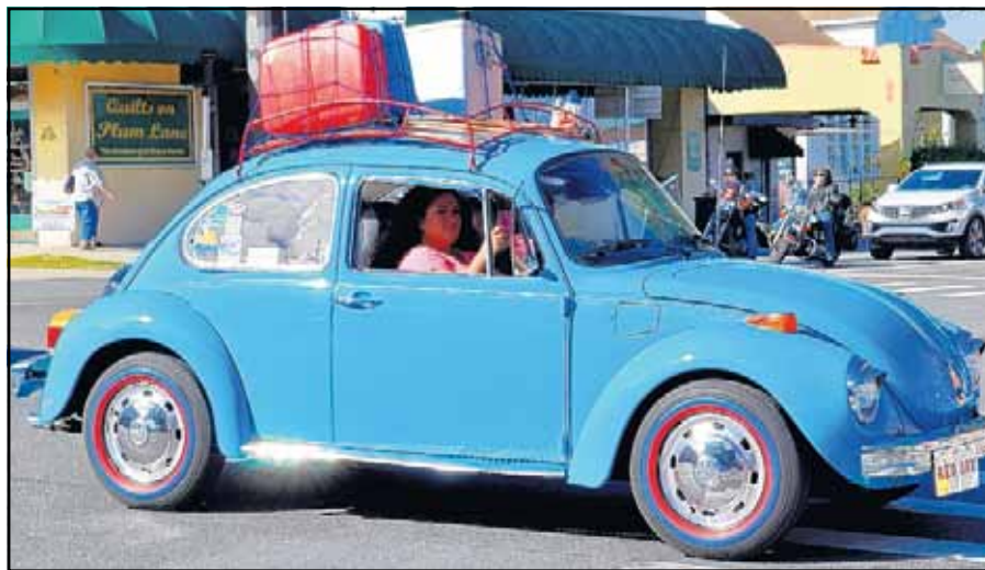
The 29th annual Bug Jam will be held Nov. 11-12 at the Pasco County Fairgrounds, including a car show, swap meet, poker run and more.