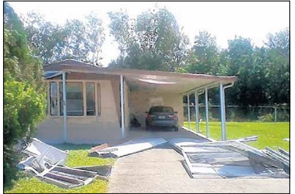
While some residences suffered some wind-related damage, overall the park stood up well against the storm.