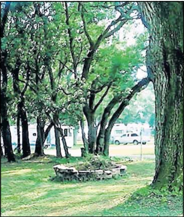
The community firepit at the Oaks at Zephyrhills.

Our new year has started off with boots on the ground. We recently installed our officers for our 2017-2018 year. As always, with responsibility comes work, but we are ready for the challenges. We are planning a breakfast on Nov. 11 from 7 to 10 a.m. The menu is scrambled eggs, toast, potatoes and your choice of sausage, pork chop or steak. Coffee is a necessity and will be onsite. The cost is $8.25 per couple or $4.25 for single. Please RSVP by email to djstrange69@gmail.com or via text to (352) 424-3190. We are anxious to meet and greet new people. Welcome. The clubhouse is located at 39442 County Road 54 in Zephyrhills.