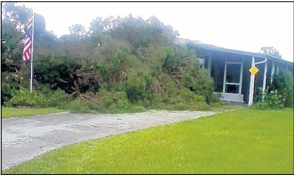
A tree fallen right next to a Gem Estates residence.

after Irma went through. They cleared all the debris and it was hauled away before us winter residents returned.