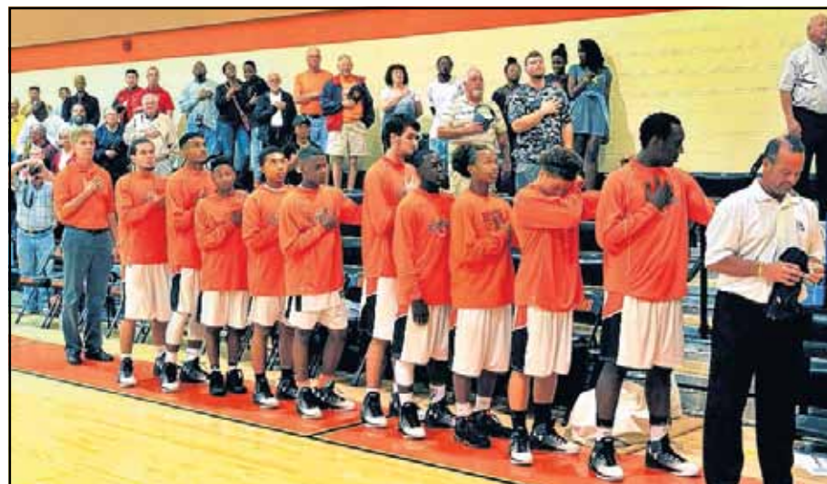
The Zephyrhills Bulldogs honor the flag before last Friday’s game against rival Pasco High School.