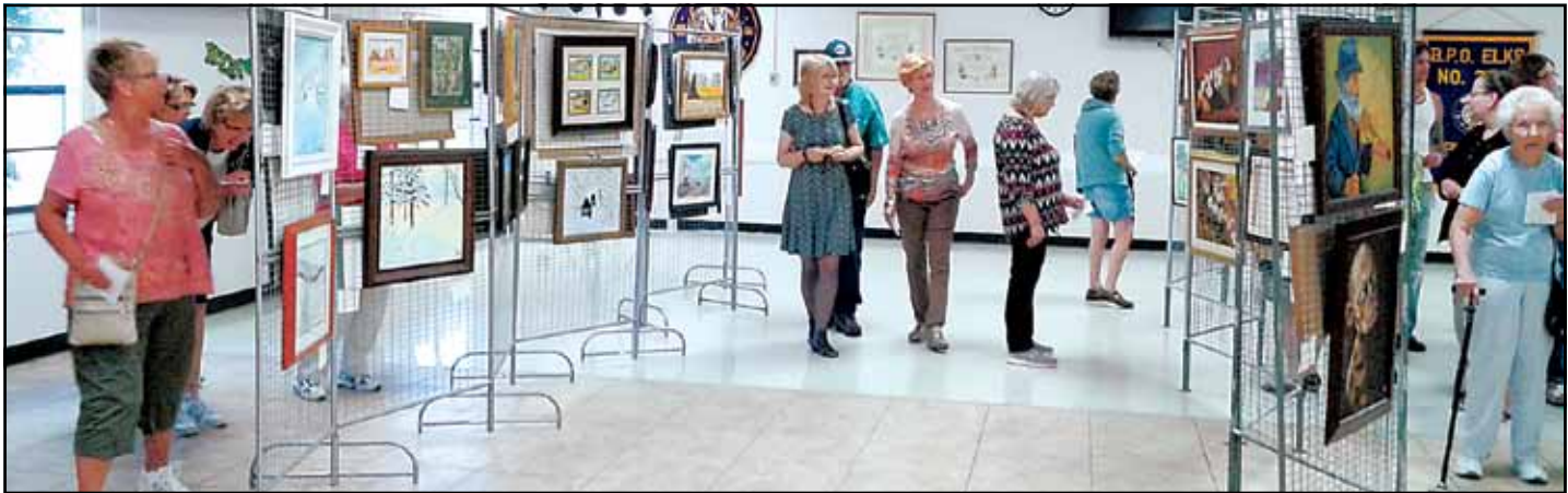
Shoppers and art lovers peruse the various works set up at the Elks Lodge #2731 on March 18 and 19.