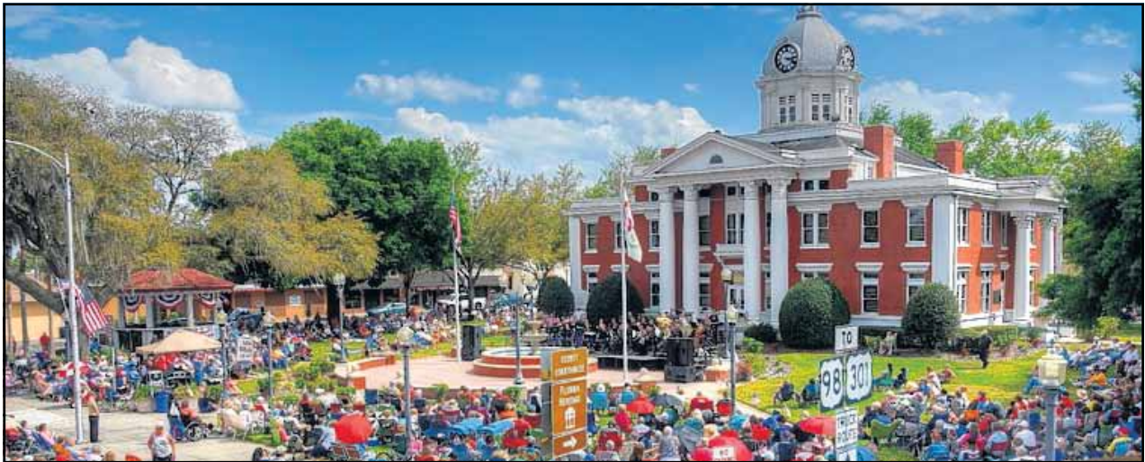
The Parris Island Marine Band’s Sunday afternoon performance in front of the Historic Pasco County Courthouse as seen from Ladder 32 of the Fire and Rescue station on Centennial Road.