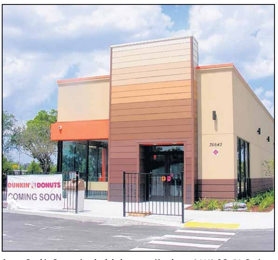
A new Dunkin Donuts is scheduled to open Monday at 36643 S.R. 54. Business hours will be Sunday through Thursday from 5 a.m. to 10 p.m. and Friday and Saturday from 5 a.m. to 11:30 p.m.