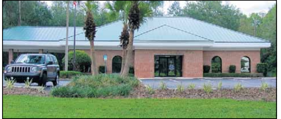
A grand opening and ribbon cutting ceremony for Railroad & Industrial Federal Credit Union will be held on June 22 at the former location of Center State Bank on State Road 54.

The Greater Zephyrhills Chamber of Commerce will hold a ribbon cutting at the credit union at noon on June 22. There will also be business networking