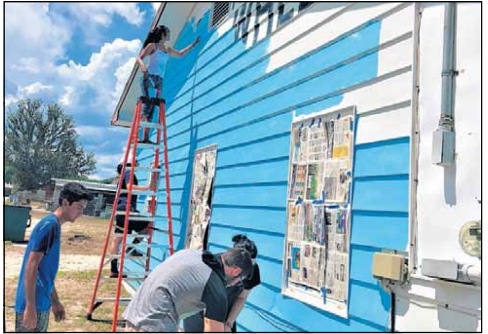
Climbing the ladder was no easy feat. The hardest part of the process for most of the students was tackling their fear of heights.

The mural is expected to be completed in the upcoming weeks and will feature a whimsical design. Zephyrhills residents are advised to keep their eyes open for a new splash of color appearing in their town. Visit www.mealsonwheelsamerica.org to learn more about Meals on Wheels and the services they offer.