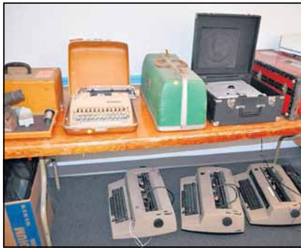
In addition to modern technological items up for auction, bidders can get a blast from the past with typewriters and other antiquated tools.