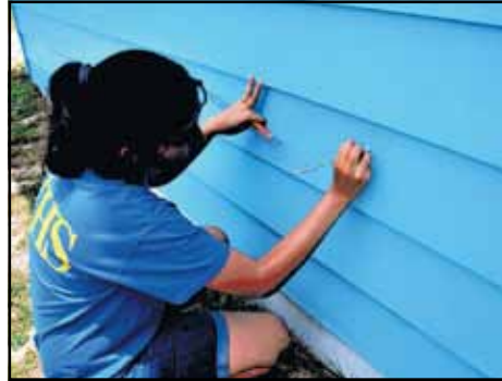
Creating the mural consisted of many steps. To ensure the best quality, the students outlined the images prior to painting them.