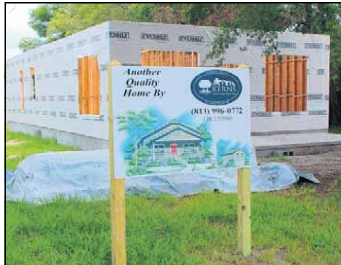
A new house rises on a lot on Ninth Street that previously had $14,000 in code enforcement fines and fees levied against it. The liens were waived under a new program implemented in June by the Community Redevelopment Agency.