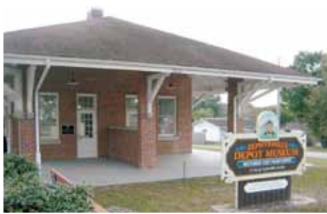
Zephyrhills Depot Museum