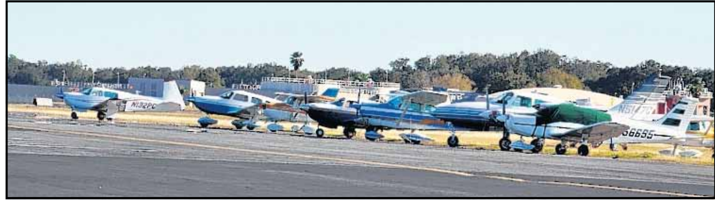
Taxiway B at Zephyrhills Municipal Airport will benefit from a $2 million grant from the U.S. Department of Transportation. Additional lighting is also included in the rehabilitation plan. File Photo