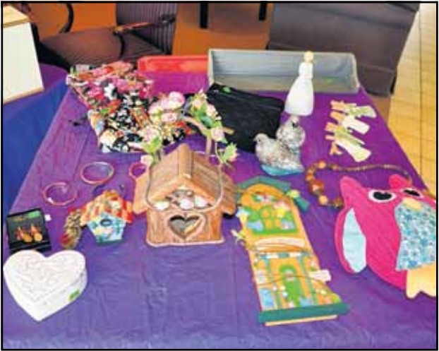
Housewares and knick-knacks are common at the Pop Up Shop which is held every Friday from 9 a.m. to 5 p.m. until the end of September.

Gulfside store managers have been setting up a ‘Pop Up Shop’ in the bank’s lobby at 6930 Gall Blvd., where several tables display what the stores offer. The shop inside the bank is set up every Friday from 9 a.m. to 5 p.m., through Sept. 29.