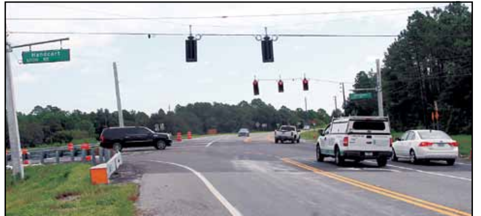
A long-awaited traffic signal at Eiland Boulevard and Handcart Road is now activated and is hoped to make the intersection safer.

Pasco County Commissioners are pleased to announce this latest traffic improvement as they work to keep our roads safe.