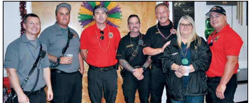
Members of the Zephyrhills Fire Rescue team stopped by the Elks Lodge on Wire Road on Friday to wish children good luck in the upcoming school year. The department has supported and volunteered with the Feed the Kids program for two years.