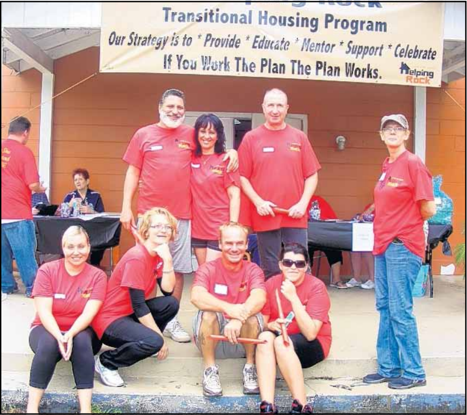
Some of the residents of A Helping Rock pause during their work on Tuesday at an inaugural outreach event for the homeless.

The Samaritan Project helps to prevent homelessness by providing money to people who are about to be evicted. It serves as a one-stop shop for people who