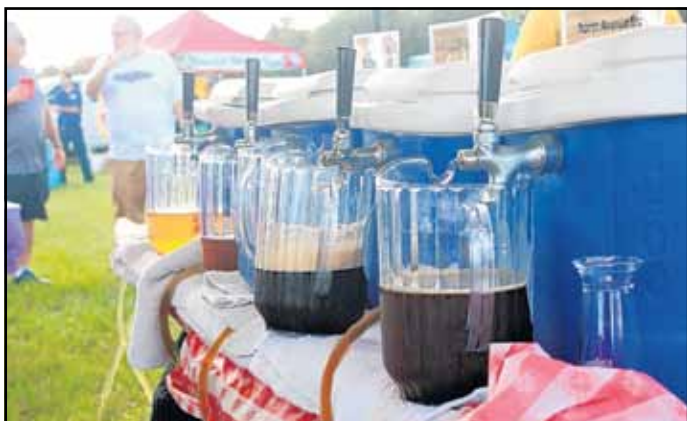
Craft brews were on tap at the Gulfside Regional Hospice BrewFest fundraising event on Saturday.

Gulfside has a successful similar event on the west side of