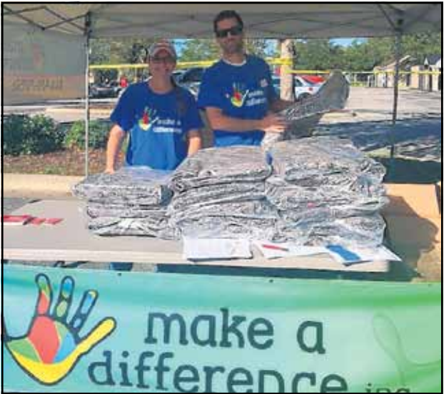
Volunteers from the Dade City outreach program wait to hand out emergency blankets to local families.

Following the successful outreach last Thursday,