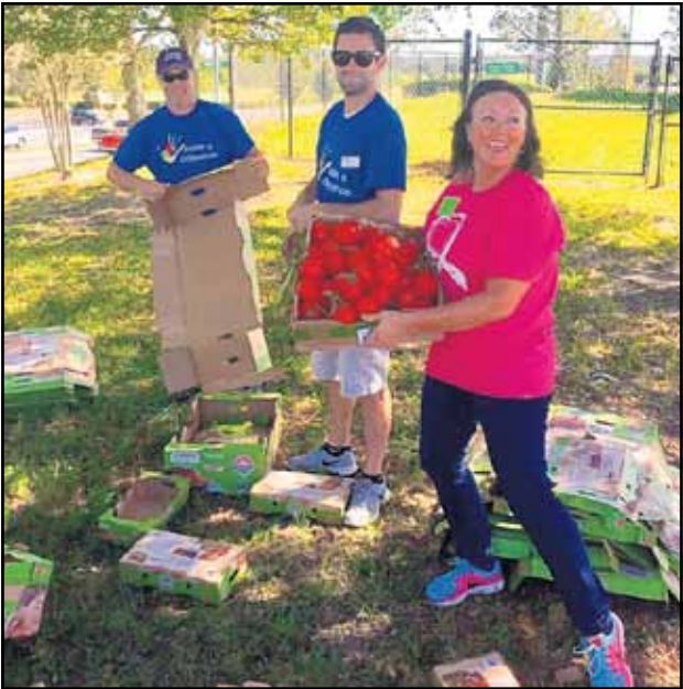
Food donated from Feeding Tampa Bay made up the majority of the pantry. Food was sorted and organized into bags to hand out for each household.