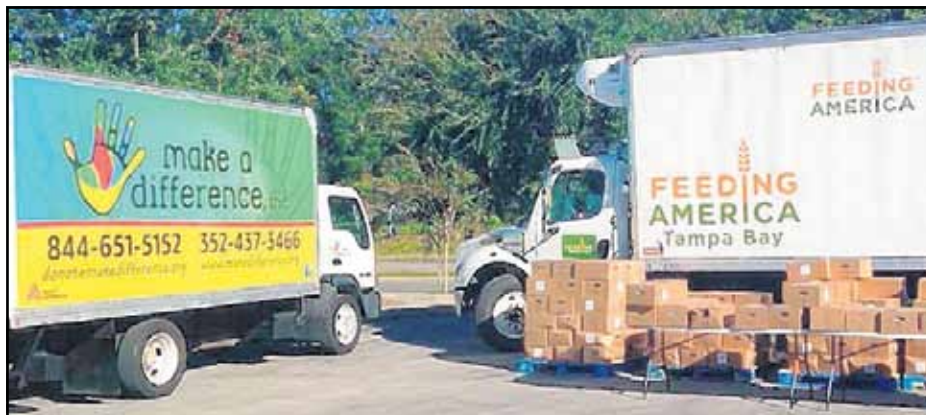
Delivery trucks from Make A Difference, Inc. and Feeding Tampa Bay parked in the Lowe's Zephyrhills parking lot on Oct. 12 for a mobile food pantry relief event. Photo Provided