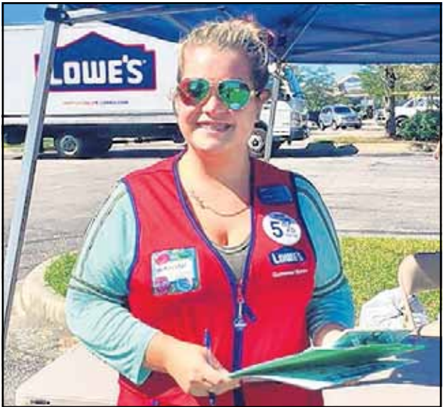
Lowe’s employees volunteered their time for the event, helping to sign in and register families and organize the two-hour event.