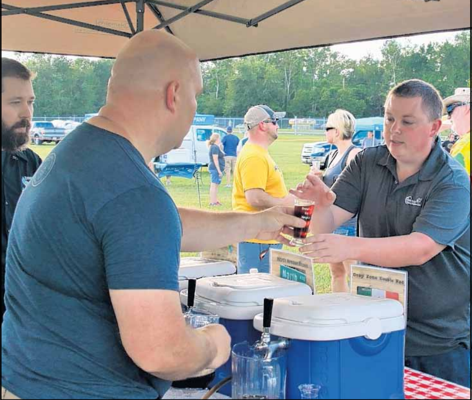
The North Avenue Brown Ale was introduced by the Zephyrhills Brewing Company at the Gulfside Regional Hospice Brewfest last weekend.