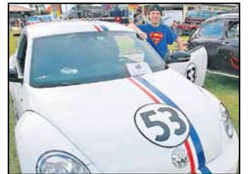
The fairgrounds open Saturday at 11 a.m., and Sunday at 9 a.m. General admission is $10 per day. Children 10 and under attend free with a can of food donated. Parking is $5.