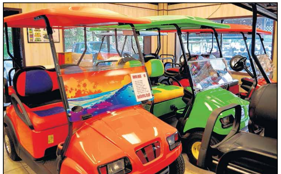
Jomax Golf Carts has seen a rise in the desire for custom carts, where customers can pick out all of the details from colors to accessories.

Jomax Golf Carts is located at 37746 Eiland Blvd., and can be reached by calling (813) 788-5539 or visiting www.jomaxgolfcarts.com.