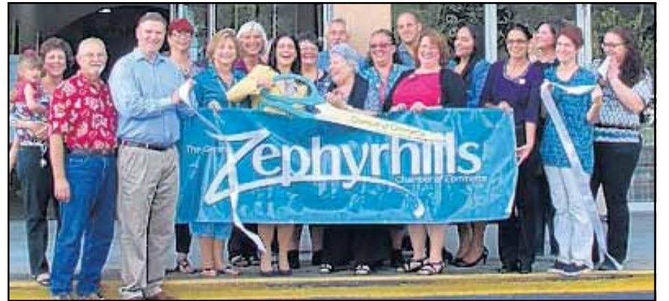
The community and the Greater Zephyrhills Chamber of Commerce gathered at the new Gulfside Zephyrhills Furniture Shoppe on Oct. 28 for a grand opening and ribbon cutting. The specialty store will showcase furniture, art, home furnishings and appliances. All store proceeds benefit Gulfside Hospice and patient care in Pasco County.

For more information about the Gulfside Zephyrhills Furniture Shoppe or the other five Gulfside Hospice Thrift Shoppes, visit www.GHPPC.org or call (800) 561-4883.